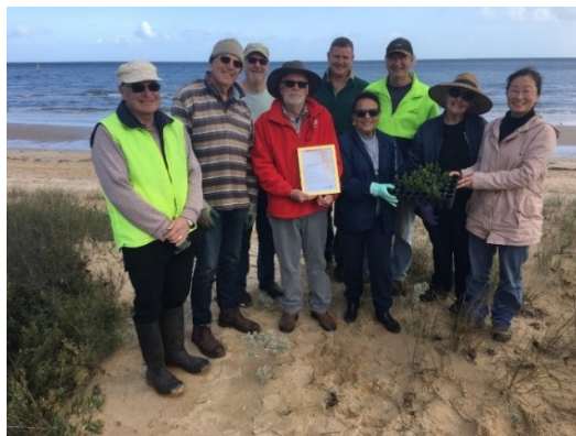
FBA: Proud Winners of a Keep Victoria Beautiful Award 2019

In light of the COVID-19 pandemic restrictions, one of our funded projects has been extended from May 2020 to November 2020 and requests have been submitted for extensions to our other grants, one Victorian Government (Coastcare) and one Australian Government funded grant (CEP).